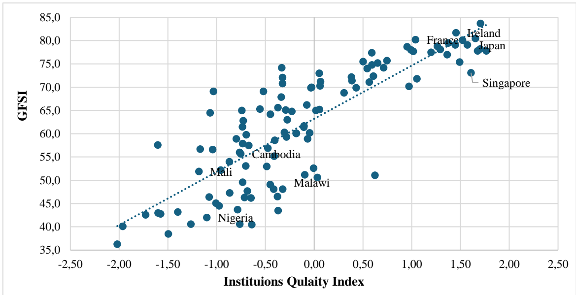
FIGURE 3. Food Security and Institutional Quality-2022

Notes: GFSI: Global Food Security Index.